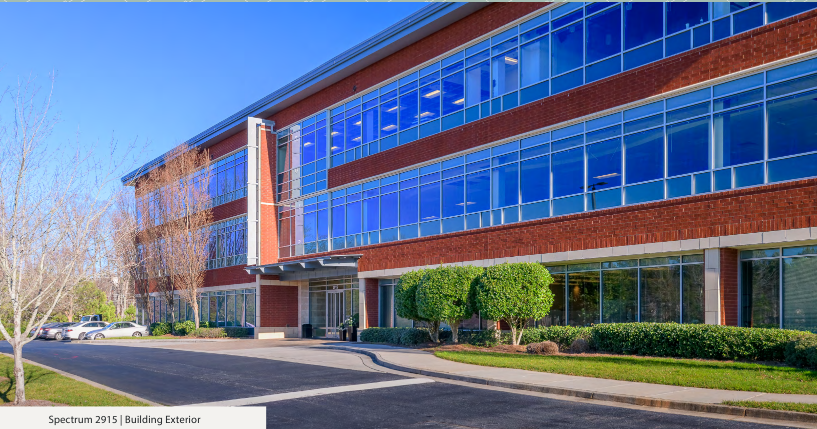
Spectrum 2915 | Building Exterior